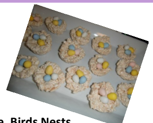
Rocky Road Brownies, Applesauce Cake, Birds Nests